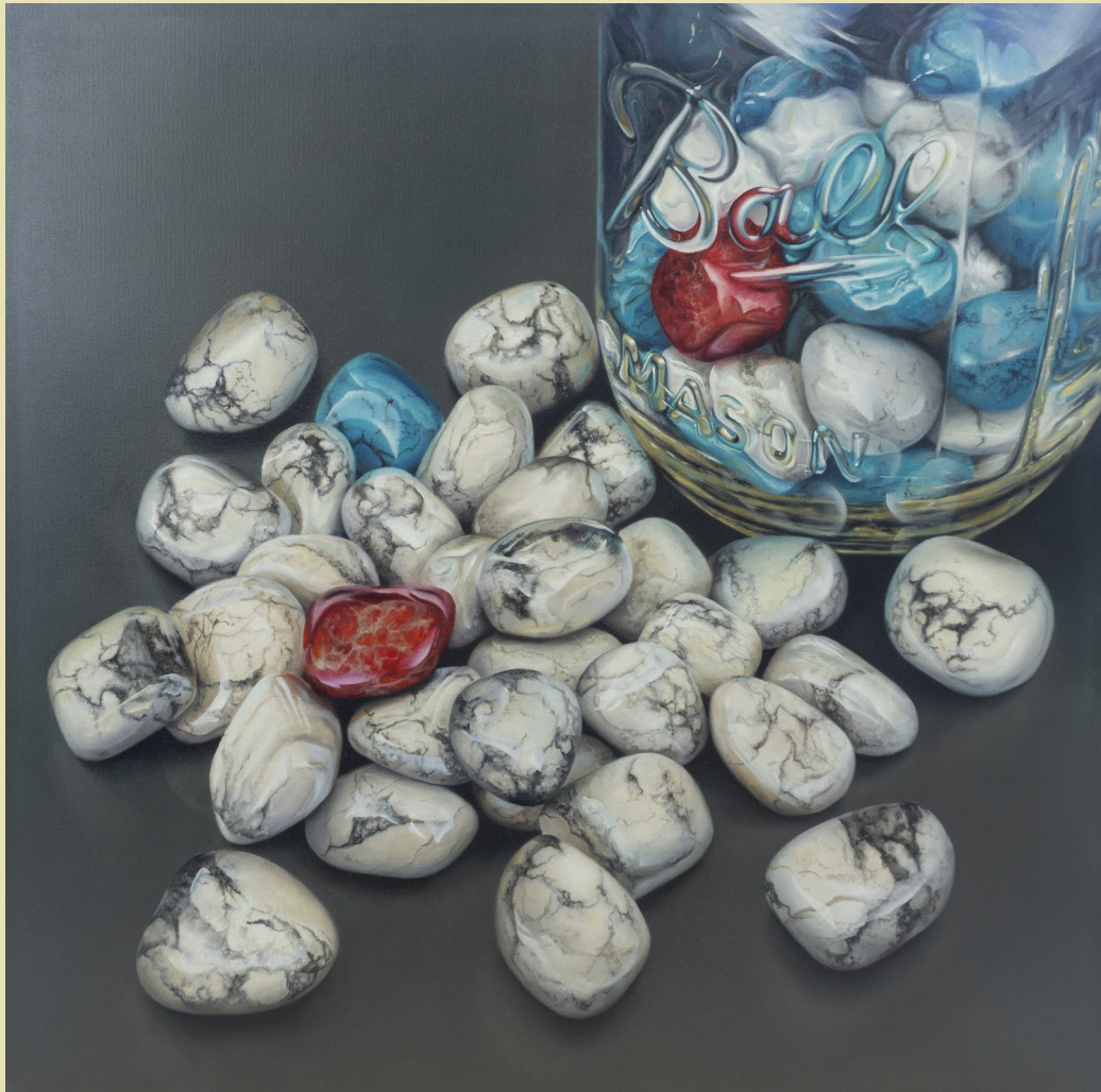
Top: "The Great Escape" Oil on canvas, 30x30 in