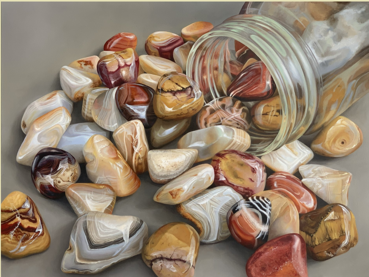
Bottom: "Infinite Hope" Oil on canvas, 40 x 40 in