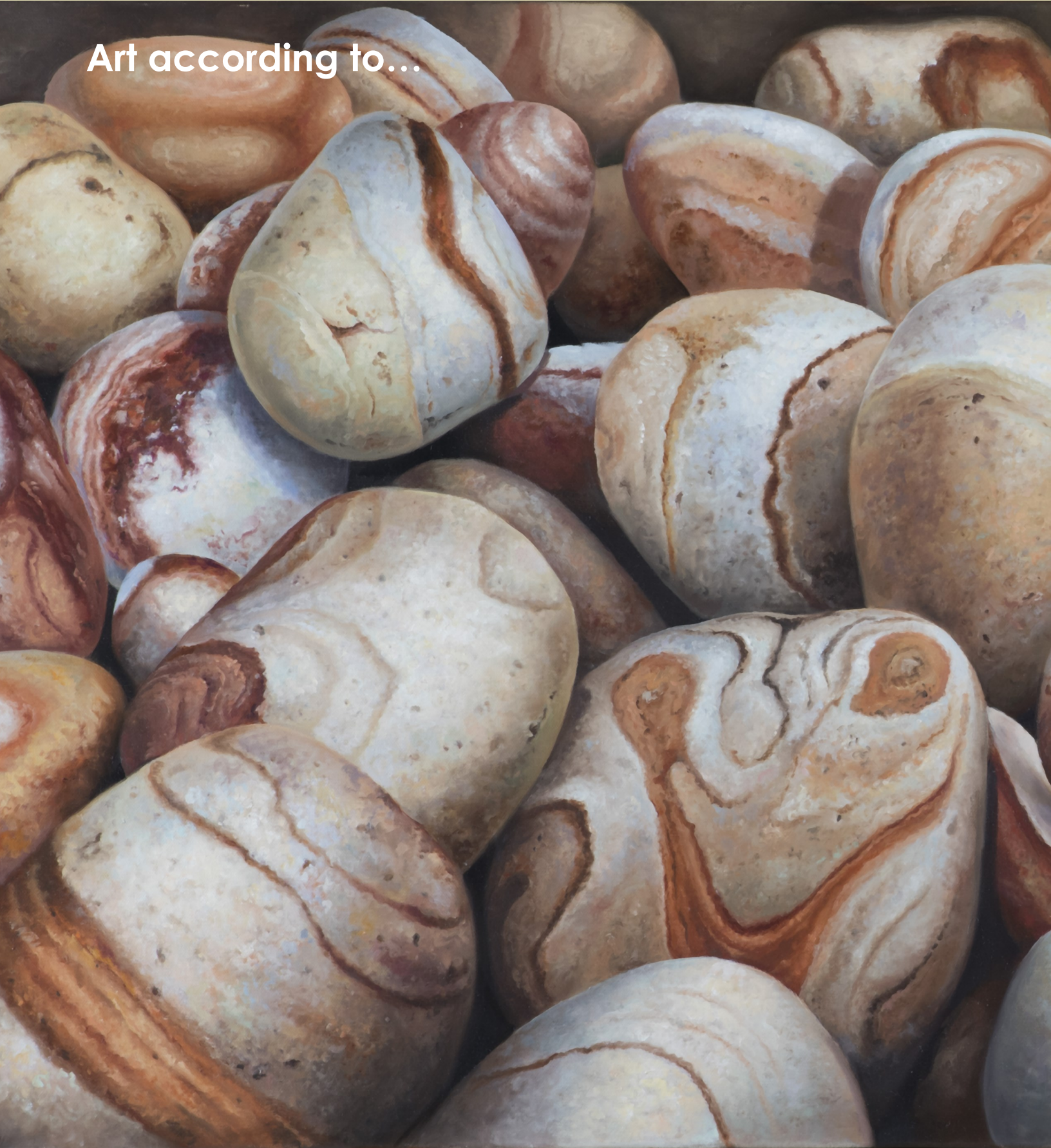
"Rainbow Stones" Oil on canvas, 24 x 48 in